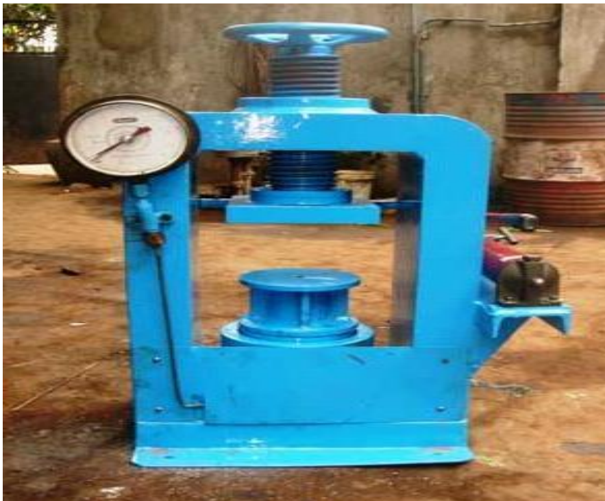
Figure 1: compression testing machine

Compressive load was applied on the composite using UTM Machine and the following parameters were determined. The mechanical properties such as ultimate breaking load, displacement at maximum force and ultimate stress were determined and tabulated in Table 4.Under compression test of fibres tested, the ultimate tensile strength of banana is higher as compared with allover combinations and shown in Figure 1