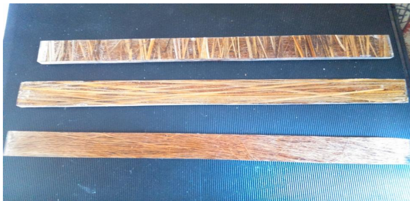
Figure.2.compressive Test Specimen

The compression specimen is prepared as per the ASTM D638 standard. A compression test involves mounting the specimen in a machine and subjecting it to the compression. The compression process involves placing the test specimen in the testing machine and applying compress to it until it fractures. The compress force is recorded as a function of displacement. During the application of compression, the elongation of the gauge section is recorded against the applied force