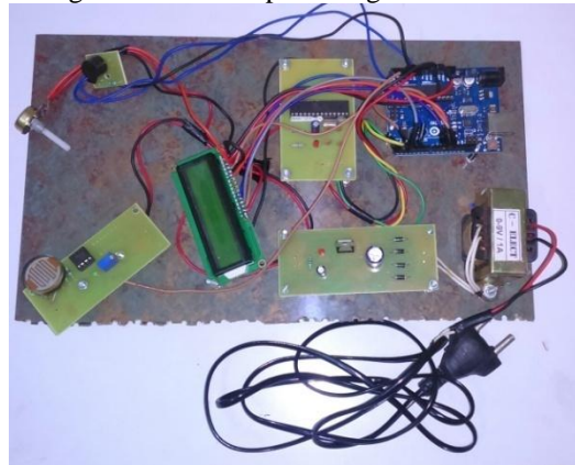
Fig 1.3: Hardware part of light receiver.