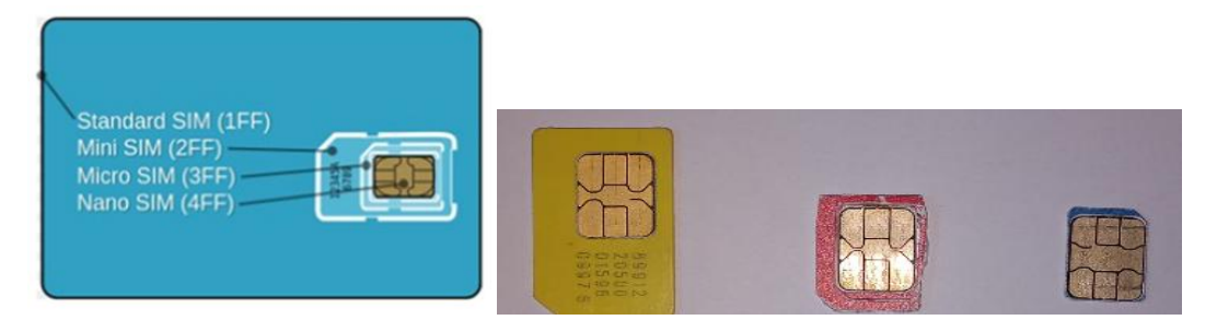
Figure 1(a): Shape of SIM card Figure 1(b): Sizes of Mini, Micro, Nano SIM cards