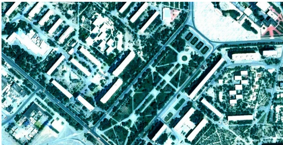
Fig.1. General view of the residential area (master plan) Zerafshan.

The shape or configuration of the courtyard of multi-storey buildings to a certain extent depends on the angle at which the streets intersect, restricting the territory of the microdistrict. This angle can be 90 0 or other. The planning structure of the yard is largely determined by climatic factors. For example, in the desert zone, where dusty winds, storms in the course of a year is 20 days or more, yard spaces of a closed structure are recommended. All sides of the four or multilateral courtyard are equipped with residential buildings. The distances between the facades and the end of the buildings should be taken according to town planning standards (13.5m - in 4-storey and 24m - in 9-storey buildings).