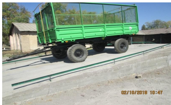
Figure 4 Chassis assembly with a body on a slope when assessing effectiveness of parking brake system