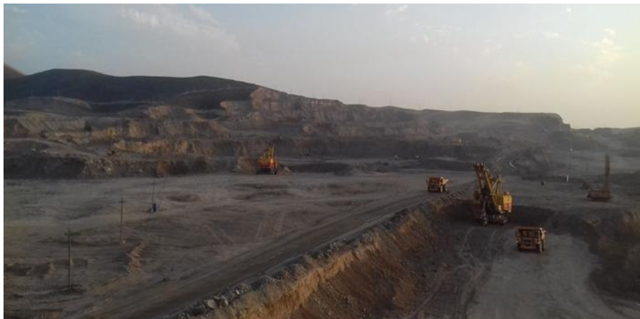
1. Fig. Development of stripping operations at the Yoshlik-1 deposit quarry

During the operation of the quarry, an autopsy scheme using a car spiral exit ensures the efficient operation of heavy vehicles. The opening of the ledges in the working area of the quarry is carried out by temporary automobile exits [3].