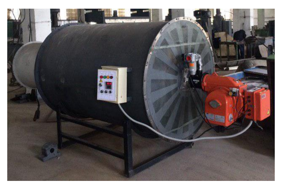
Fig. 2. General view of the developed and manufactured heat generator TGU

The heat generator was installed in the drying line for the raw cotton of the Baghdad cotton gin instead of the IICH-1.9 heat generator. According to the test results, the developed heat generator saved natural gas consumption of 30-40% compared to the existing IICH-1.9 [4].