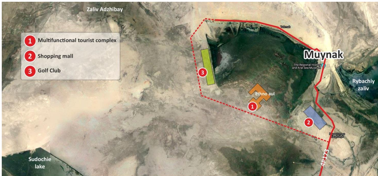
Figure: 5. Schemes for the placement of objects of tourist attraction. Option number 2

sector and catering establishments. "Ethno aul" will affect the generating factor of tourist needs, namely, the personal and social motivation of the population.