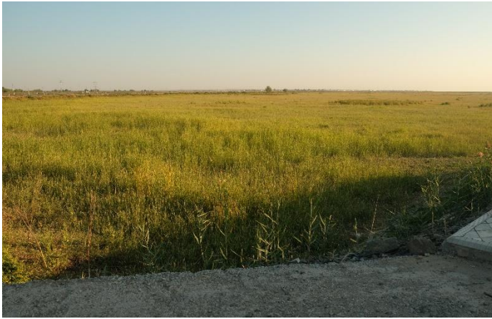
Figure: 6. The state of the territories between the Kongrad-Muynak highway and the Rybachi Bay.

An integral part of the attractive territories will be playgrounds for active games and attractions fenced with fortress walls in the style of fortifications of ancient Khorezm.