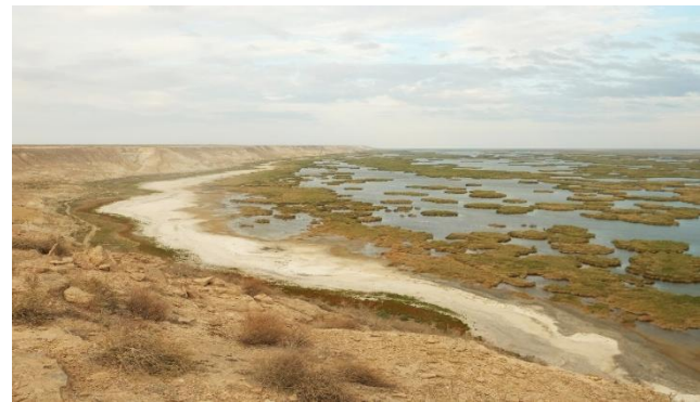
Figure: 2. Lake Sudochie in August.

The former port on the former shore of the former Aral Sea, the city of Muynak can be considered