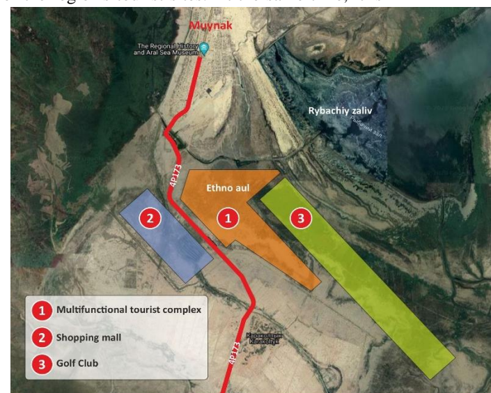
Figure: 4. Layouts of objects of tourist attraction. Option number 1

The transformation of Muynak into a transit hub will