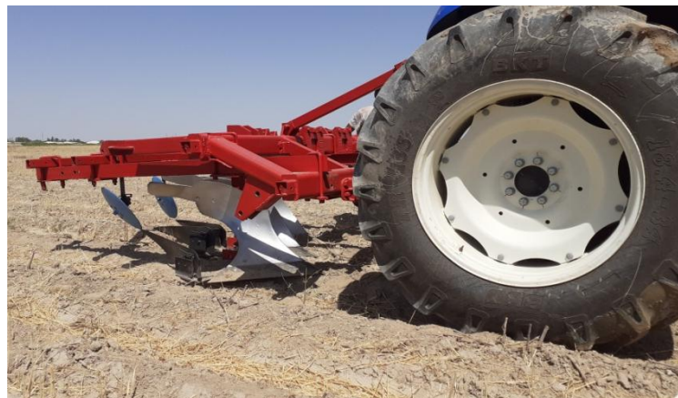
Fig. 3. General view of a linear-step plow for plowing the slopes of fields

The authors developed and manufactured a linear-step plow with additional disk working bodies for plowing the soils of slope fields (Fig. 3).