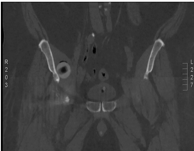
Figure 2. Coronal CT scan section shows trial femoral head