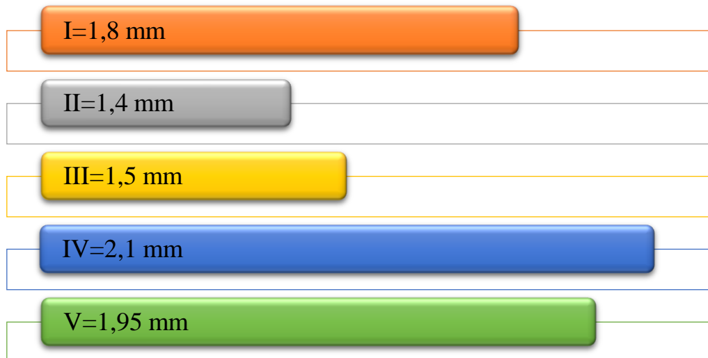
Fig. 3 Thickness of two-layer knitted fabric

When the V variant of a two-layer knitted fabric a decrease in the bulk density of the knitted fabric is achieved by changing the methods of joining the layers of the two-layer knitted fabric.