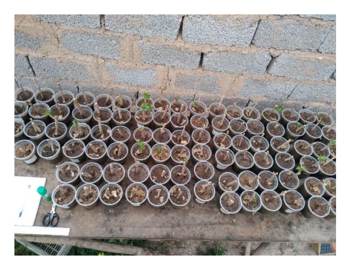
Figure 2. Planting processed grape cuttings in 300 gram pots.

Processed grape cuttings (375 cuttings) were planted on April 10 in 300-gram containers. It should be noted that all cuttings are made from ripe annual varieties of one grape. 3.8-liter plastic containers were used to electrically process the cuttings. The electrodes in the electrical processing unit are made of stainless steel, the electrodes are 7 cm wide, 16 cm long and spaced 25 cm apart.