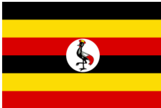
Figure 1 Uganda National flag

The flag was adopted in 1962, the same year that Uganda obtained her independence from the United Kingdom. The various colors indicate various concepts. The black color depicts Uganda as a predominantly black African country. The yellow color represents the plentiful sunshine Uganda receives all year due to its location near the Equator, and the red color represents the blood of brotherhood with the fellow Africans and the rest of the globe. The national bird is a visual element of Uganda, it matches with the colors of the flag. The crane stands on one leg to represent progress, evolution and motion.