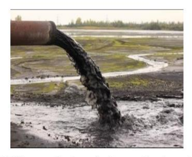
Fig 1.1 Effluent outlet from the factory directly to the river source

Water is one of the most important substances on earth. All plants and animals must have water to survive. Water pollution is contamination of water bodies, usually as a result of human activities. Due to increase in urbanization and industrialization a large quantity of inadequately treated water is left into natural water bodies which can lead to degradation of aquatic eco system. This can lead to public health problems for people leaving downstream and leading worldwide cause of death and disease. Nowadays water treatment is mandatory process before releasing the effluents outside the factory directly to the river. Major steps are taken in the treatment of water hence improving the quality of water to make it more acceptable for specific endues.