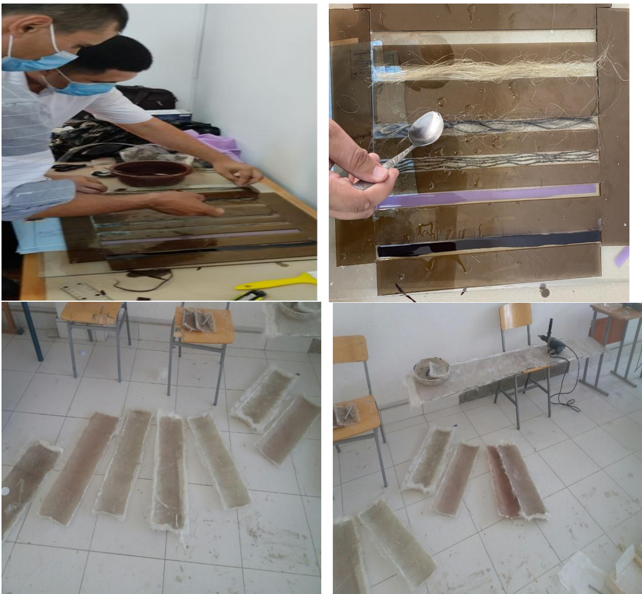
Fig. 1. The process of testing local fibers and making turbine parts using these fibers.

According to the results of experimental experiments, it was found that the strength of different types of products (fibers) is different (The experiments were conducted using laboratory devices WP-950, WP-300.). Depending on the local availability, it is possible to increase the strength of the turbine by using products such as goat hair and horse