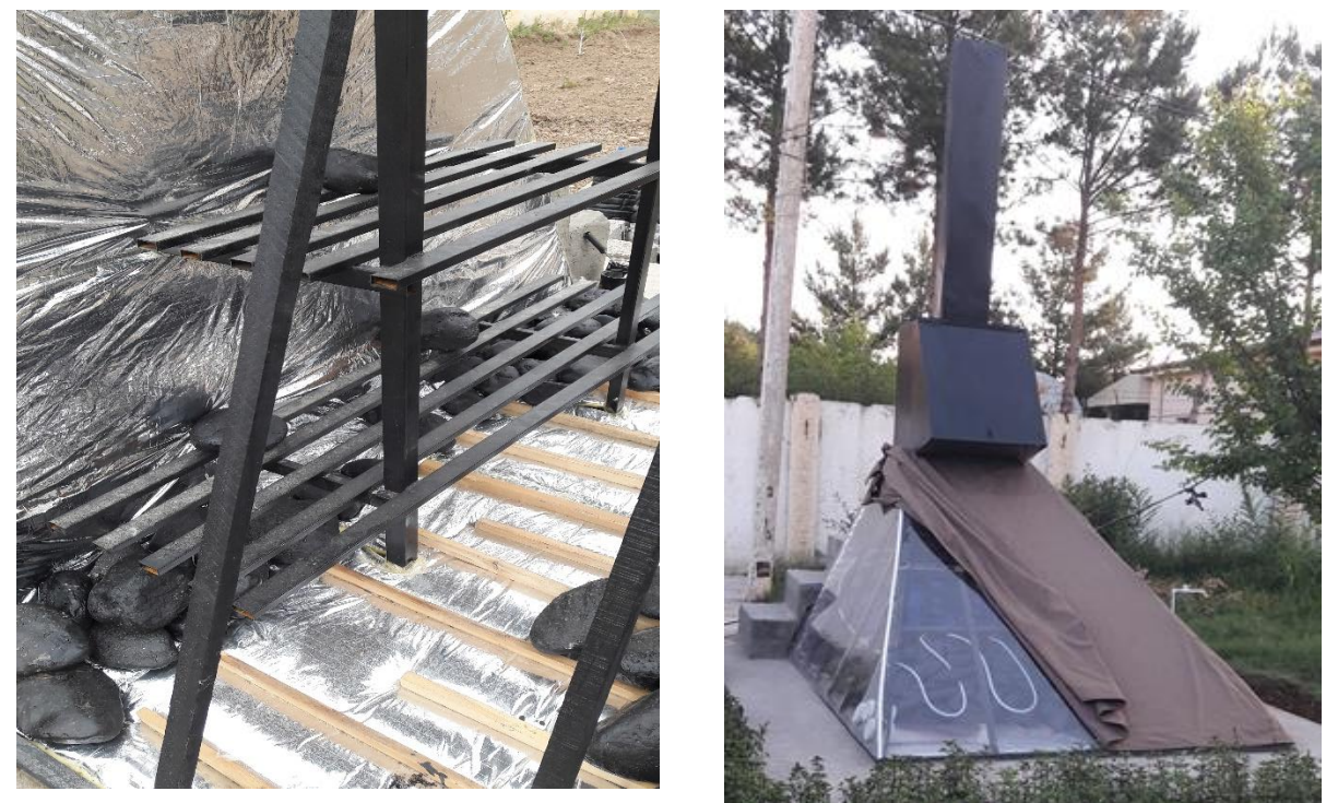
Figure 1. Insulation of the base and sides of the collector.

The Collector part of the solar dryer heat accumulator will consist of a transparent film layer, studs that provide air circulation, an iron cabinet for the drying product. The principle of operation of the solar collector is that the sun's rays pass through a transparent layer and are absorbed by the elements of internal air and heat accumulation. The temperature inside the dryer is formed at the expense of this energy. An air stream with a Low Temperature entering from the bottom slits of the device will enter the dryer and increase the temperature so that it also evaporates the moisture of the product put for drying, bringing it out of the slits above in a convection manner. In hot summer months, the temperature inside the drying cabinet reaches 70-74, the temperature inside the collector reaches 80-85, the temperature of the heated 100 liters of water is 67 in the morning from 6:00 to 14:30 on hot summer days when solar radiation is 966. The temperature below the stelages inside the cabinet will be 74-75, the temperature above will be 73-74. The most optimal temperature inside the drying cabinet according to the kinetics of drying fruits should be 60-65 [4]. With this in mind drying to balance the temperature of the device, air inlet and outlet slits are placed on the lower and upper parts, which can also be changed in diameter.