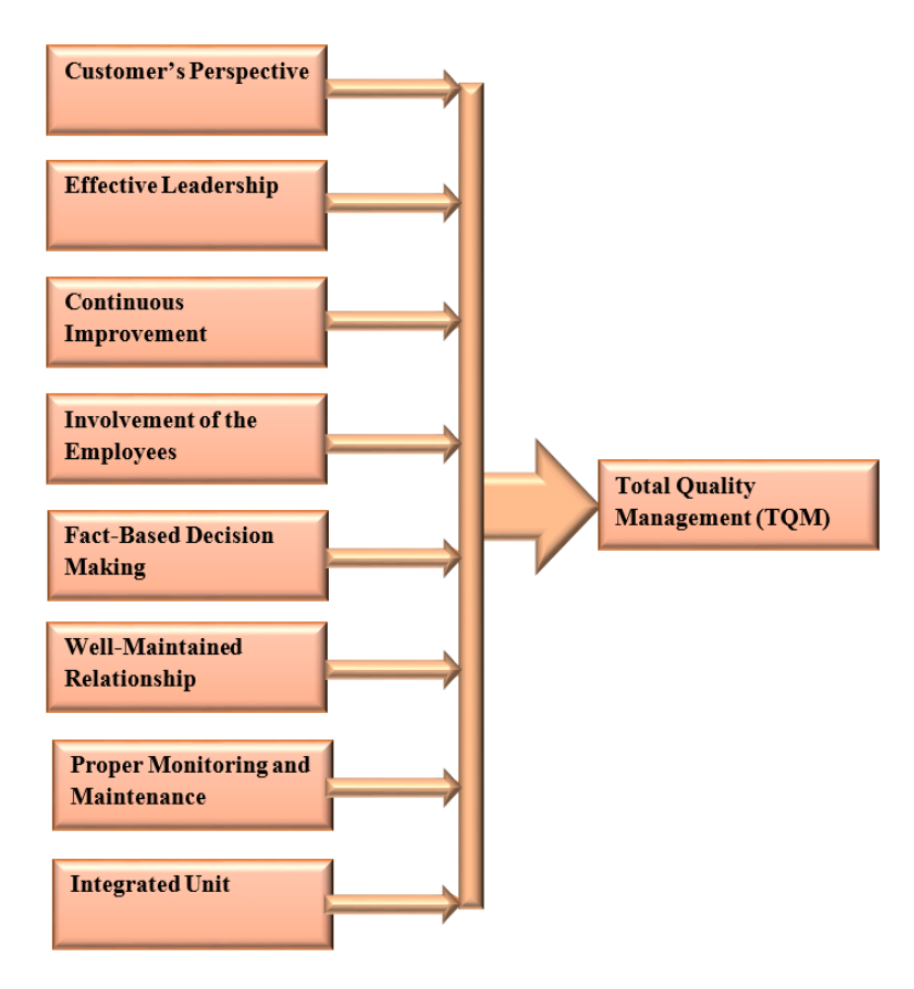
Figure 2: Key Points for Implementation of TQM