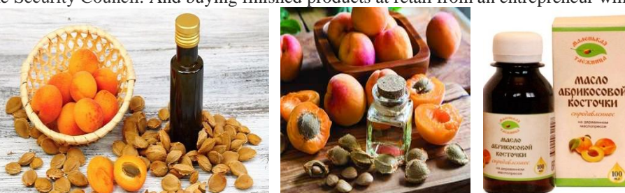
Figure 1. Apricot seed oil in a bowl

The products prescribed in the daily rations of military personnel are purchased mainly from entrepreneurs, i.e. there are no devices in the Security Council for splitting apricot and almond seeds, as well as for extracting oil from the seeds. By the relevant resolutions of the Cabinet of Ministers, dry fruits were included in the ration of food rations of servicemen of the Armed Forces of the Republic of Uzbekistan, according to which, during the period of hostilities, one cup of a hot dish is substituted for 100 g of almond kernel for each serviceman. But almond-splitting devices are not available in the Security Council. And buying finished products at retail from an entrepreneur will cost much more.